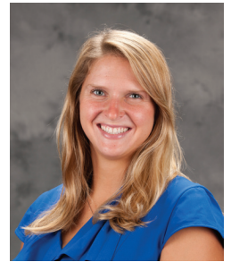
Susie Epp Communication Services